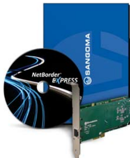
Single Port T1/E1 NetBorder Express Gateway Card with PCI-Express Interface. Supports up to 30 Simultaneous Calls. (Part Number: NBE030-F-A101DE)

Available for analog FXO and T1/E1 digital interfaces, NetBorder Express Gateway Cards are an excellent value for installations ranging anywhere from 4 to 240 simultaneous calls. For larger systems, several gateway cards can be combined in the same server to support up to 960 simultaneous calls.