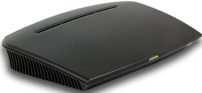
Konftel IP DECT 10